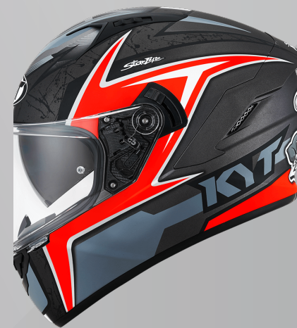
XAVI FORES 2021 REPLICA ORIGINAL MATT (YLW/GREEN) ECE CODE YSNF0038