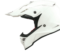
PLAIN WHITE YSSK00W3