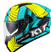
FORES 2021 REPL. ORIGINAL MATT (YLW/GREEN) YSNF0038