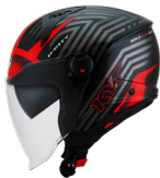
LUCENT BLACK/RED YSDC0005