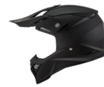
PLAIN MATT BLACK YSSK00X6