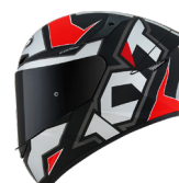
ELECTRON MATT GREY/RED - YSTT0006