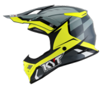
GLOWING ANTHR./YELLOW YSSK0012