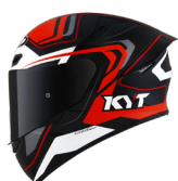
OVERTECH BLACK/ORANGE - YSTT0001