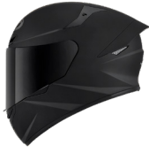
PLAIN MATT BLACK YSTT00X6