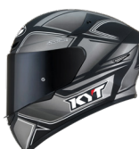
TOURIST MATT COOL GREY - YSTT0013