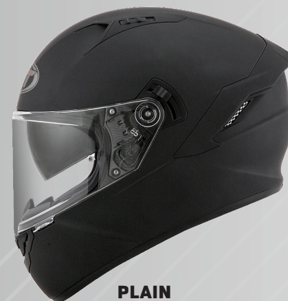
PLAIN MATT BLACK ECE CODE YSNF00X6