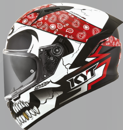
PIRATE ECE CODE YSNF0017