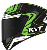
OVERTECH BLACK/GREEN - YSTT0002