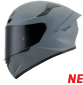
NEW PLAIN MATT GREY YSTT00X2