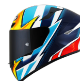
TATI REPLICA YSTT0016