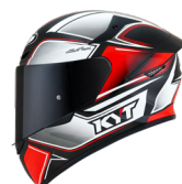
TOURIST RED FLUÒ - YSTT0012