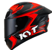
COMPETITION RED Y6NZ0018