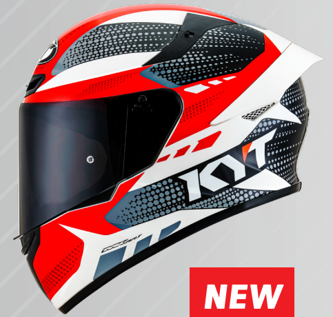
YSTT0023 GEAR BLUE/RED