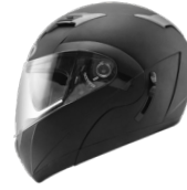
PLAIN MATT BLACK YSCN00X6