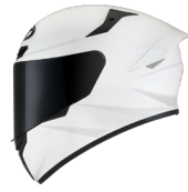
PLAIN WHITE YSTT00W3