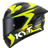
COMPETITION YELLOW Y6NZ0016