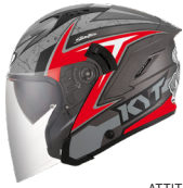
ATTITUDE MATT ANTH./RED YSNJ0009