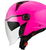
PLAIN FUXIA FLUO YSDC00WF