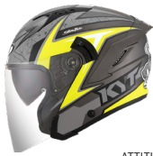
ATTITUDE MATT ANTH./YELLOW YSNJ0010