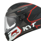
TRACK MATT GREY YSNF0006