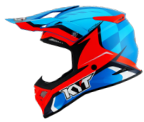
GLOWING BLUE/ORANGE FLUO YSSK0014