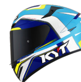
GRAND PRIX WHITE/LIGHT BLUE - YSTT0004