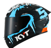
MASIA WINTER TEST MATT YSTT0019