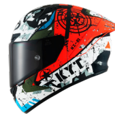
BLAZING MATT RED Y6NZ0019