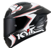
COMPETITION WHITE Y6NZ0017