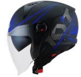
COLORFUL MATT BLUE YSDC0003