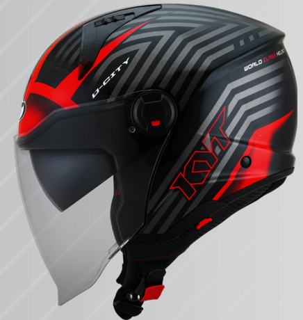
COLORFUL YELLOW ECE CODE YSDC0002