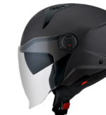
PLAIN MATT GUN METAL YSDC00X1