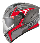
MINDSET MATT ANTH./RED YSNF0033