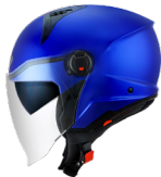
PLAIN BLUE METAL YSDC00W4