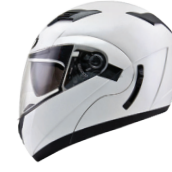
PLAIN PEARL WHITE YSCN00W3