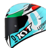
LEOPARD REPLICA TRICOLORE YSTT0017