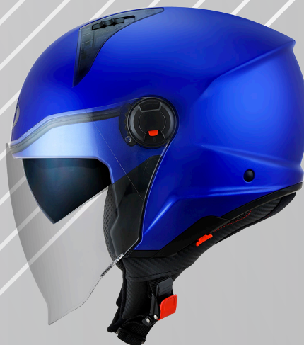
PLAIN BLUE METAL ECE CODE YSDC00W4