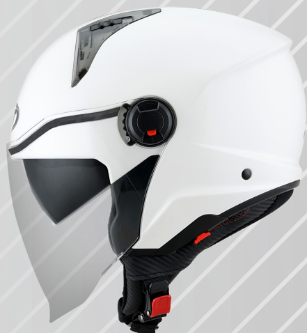
PLAIN WHITE ECE CODE YSDC00W3