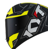
ELECTRON MATT BLACK/YELLOW - YSTT0007