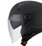
PLAIN MATT BLACK YSDC00X6