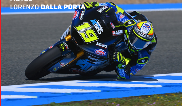
MOT02 LORENZO DALLA PORTA