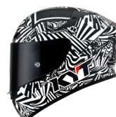
ESPARGARÒ WINTER TEST 2020 REP YSTT0014