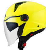
PLAIN YELLOW FLUO YSDC00W5