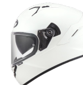
PLAIN PEARL WHITE YSNF00W3