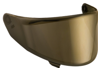
IRIDIUM ORO IRIDIUM GOLD