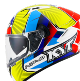
FORES 2021 REPL. BLUE/RED/YELLOW YSNF0040