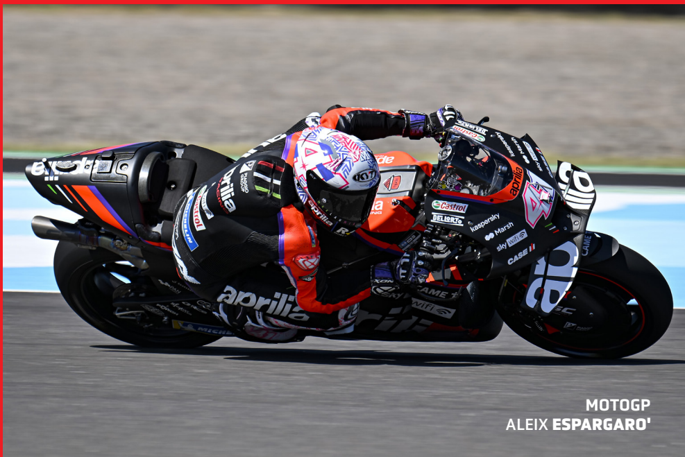
MOTOGP ALEIX ESPARGARO'