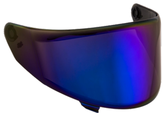
IRIDIUM BLU IRIDIUM BLUE