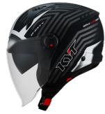
LUCENT MATT BLACK/SILVER YSDC0004