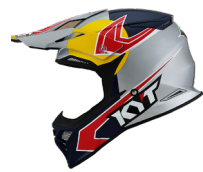
TADDY REPLICA YSSK0007