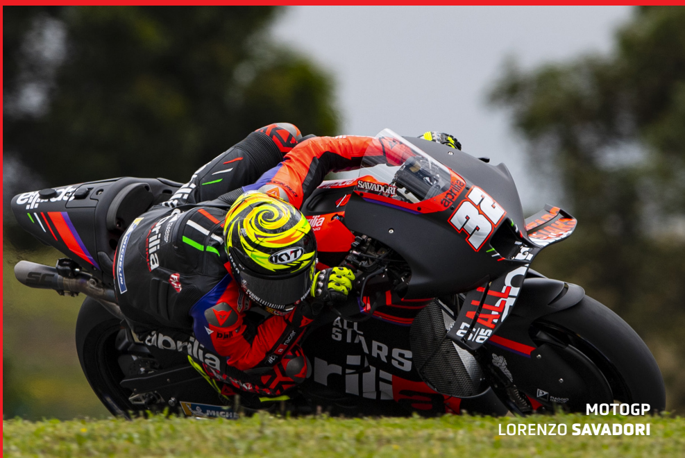
MOTOGP LORENZO SAVADORI