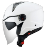
PLAIN WHITE YSDC00W3