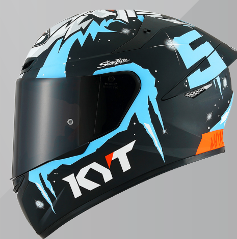
TATI REPLICA ECE CODE YSTT0016