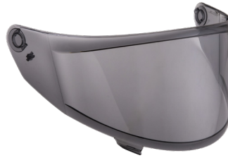
FUMÈ LIGHT SMOKE