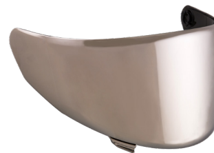
IRIDIUM SPECCHIO CROMATA IRIDIUM MIRROR CHROMED