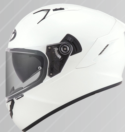
PLAIN PEARL WHITE ECE CODE YSNF00W3