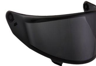
SMOKE DARK SMOKE