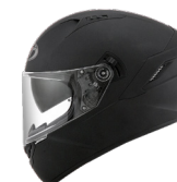
PLAIN MATT BLACK YSNF00X6