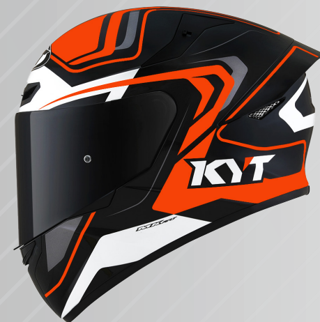
TOURIST RED FLUO ECE CODE YSTT0012