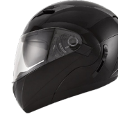
PLAIN BLACK YSCN00W6