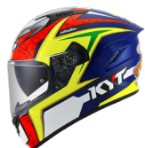
DALLA PORTA REPLICA ORIGINAL YSNF0032