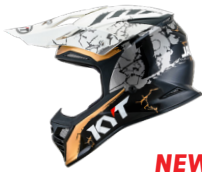
NEW JARVIS SIGNATURE EDITION YSSK0015