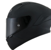
PLAIN MATT BLACK Y6NZ00X6