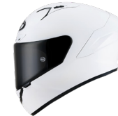
PLAIN WHITE Y6NZ00W3