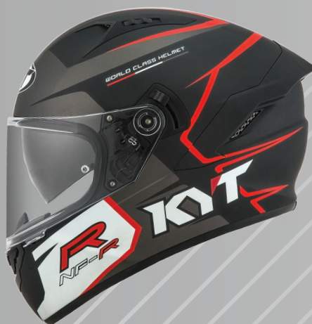
TRACK MATT GREY ECE CODE YSNF0006