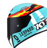
LEOPARD REPLICA SPANIARD YSTT0018