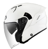
PLAIN WHITE YSNJ00W3