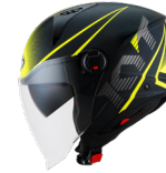
COLORFUL YELLOW YSDC0002