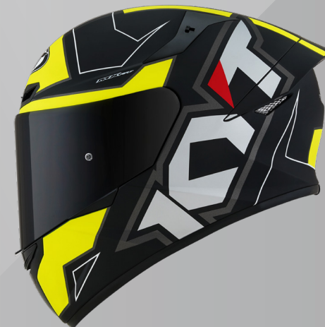
OVERTECH BLACK/GREEN ECE CODE YSTT0002