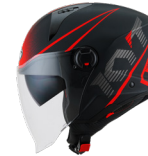
COLORFUL MATT RED YSDC0001