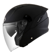
PLAIN MATT BLACK YSNJ00X6