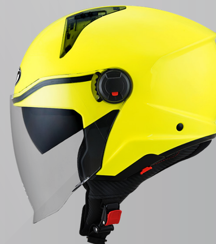
PLAIN YELLOW FLUO ECE CODE YSDC00W5