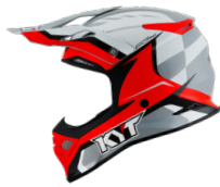
GLOWING WHITE/RED YSSK0013