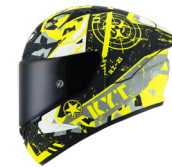
BLAZING MATT YELLOW Y6NZ0020